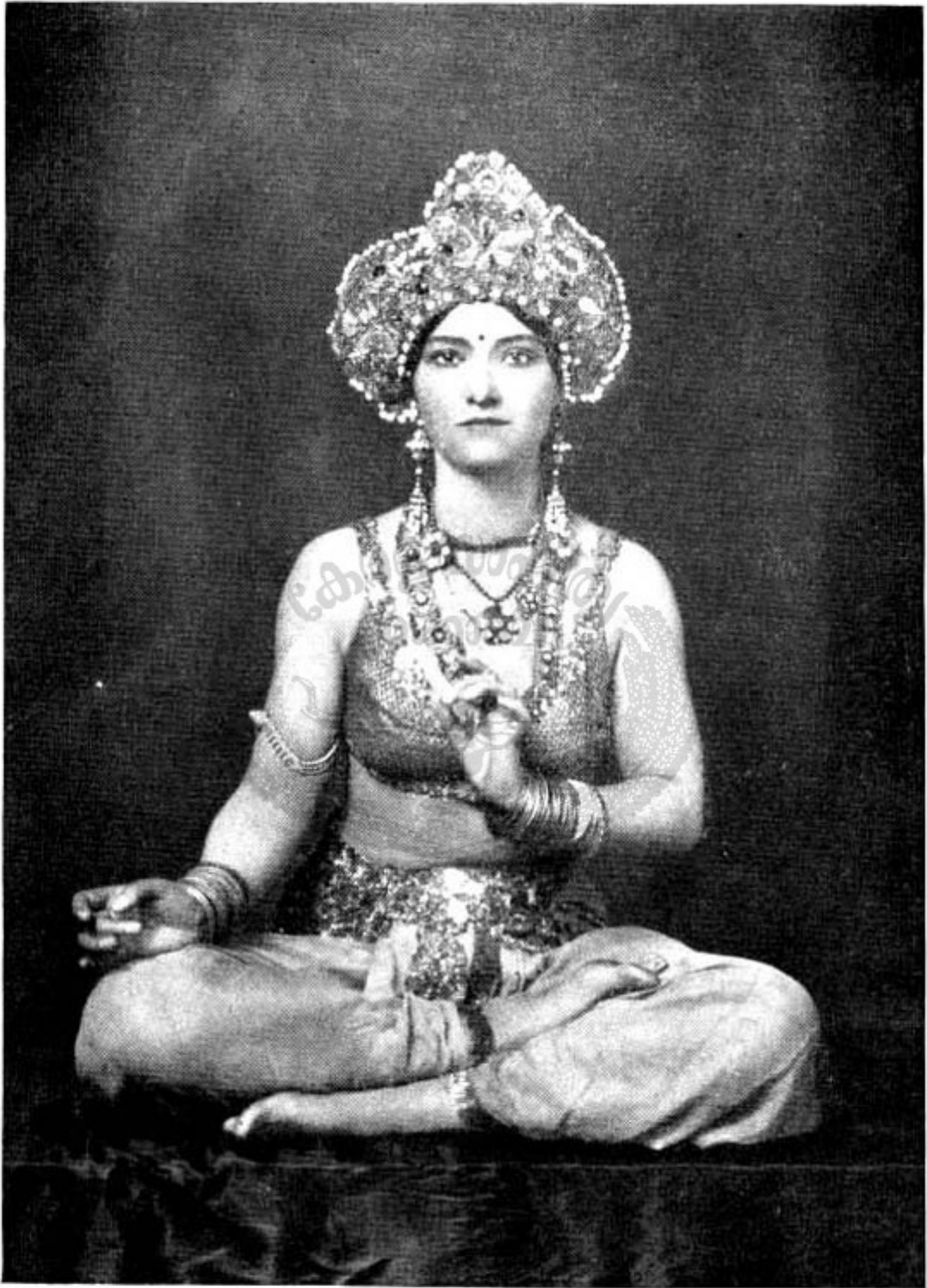
Samabhangā — A Gracious Mood